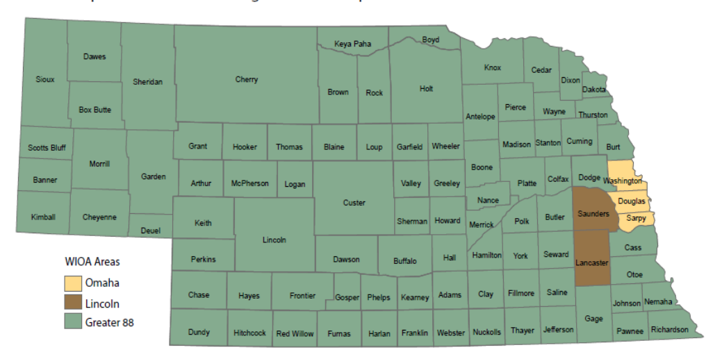
Proposed WIOA Local Designated Areas Option A - Current Local Areas